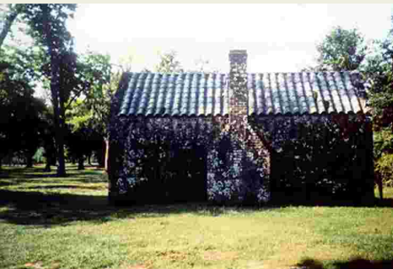
Slave Cabins North Carolina

Fraternal Groups Mason & Eastern Star American Bar Association National Black Nurses, Black Social Workers SBC Network Conference AARP Conference