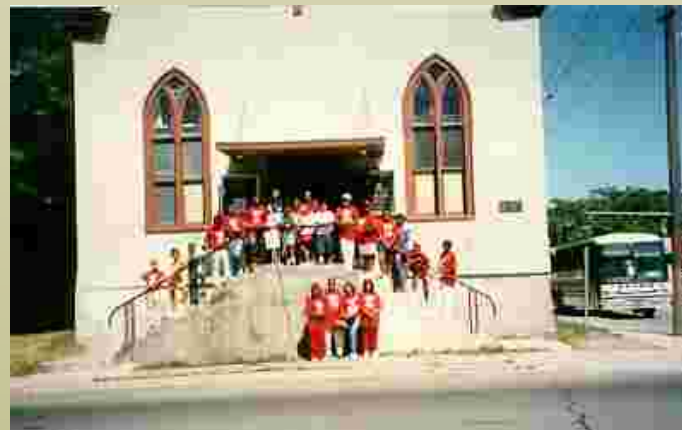
Last Stop on Harriet Tubman's Underground Rail Road

Whether you're attending a conference, bringing a Youth or Senior group, we can get you there safely and on time. If you're visiting Chicago, let us point out the history, heritage and culture of African-Americans in Chicago on the way to and from your event. We can tell you about the history and congregations of some of our leading and historical churches like Pilgrim Baptist where Thomas Dorsey wrote Amazing Grace or the oldest Black church in Chicago and the choir where Mahalia Jackson got her start.