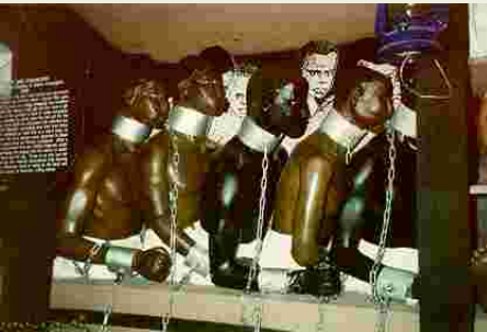
Young Men On A Slave Ship