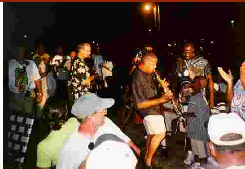
Live Jazz Oklahoma Tour

We know how jam-packed a professional convention can be. We also know that spouses and children appreciate a program that is flexible enough to allow them to lounge in the hotel room or the pool but rigorous enough to let them go home saying that they saw all of Chicago. We can't show you everything, but if you've got a couple of days in Chicago and a heavy schedule, we can take care of you and yours. We can show you the standard stuff like the Sears Tower, Michigan Avenue shopping and Chicago's Museums as well as the place where Jean Baptist Pointe DuSable founded Chicago, where our Underground Railroad operated and "neighborhood" shopping. We have hosted 30,000 member conventions and groups as small as 30.