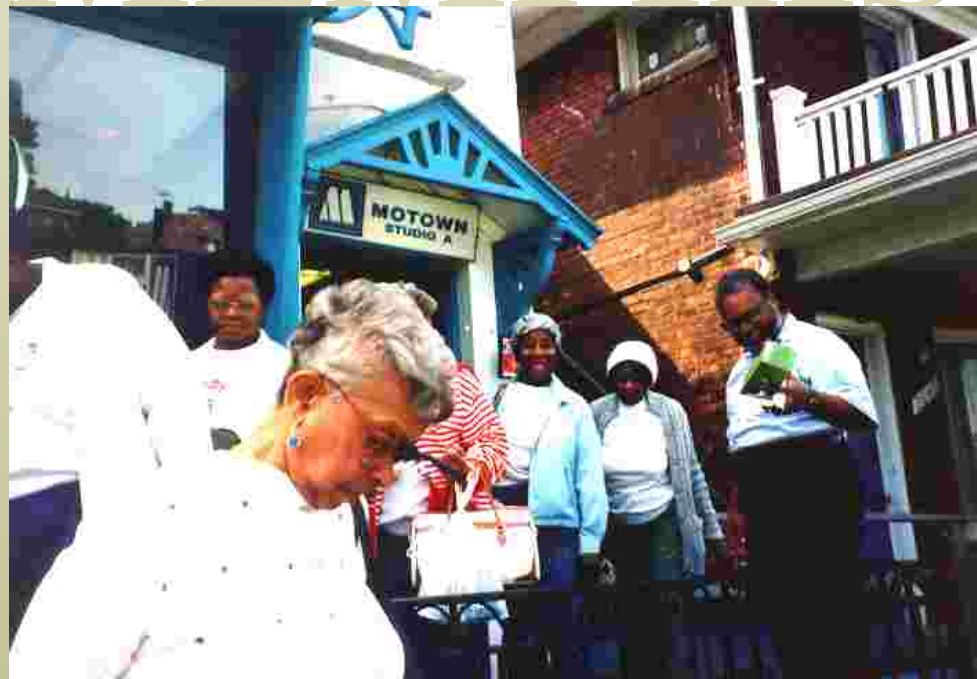
Senior Citizens at Motown Studio