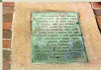
Site of (Roots) Kunta Kente's Landing site