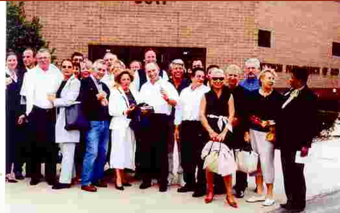
Motorola Germany Corporate Group