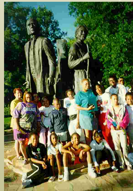
Monument Honoring Harriet Tubman

It's important for children to understand history, especially history that they might not be familiar with or that relates specifically to them. Of course, they need a healthy dose of entertainment to help the education go down. Our Soul Side of the Windy City Tour combines important historical and cultural sites like The DuSable Museum, The Defender Newspaper, the Ebony/Jet showcase and Jesse Owens' gravesite with Michael Jordan's statue, Oprah Winfrey's studio and R. Kelly's neighborhood. We also leave time for the young ladies to go shopping and the young men to play video games. Food? Of course! We have a couple of phenomenal Black establishments in our hip pocket that you can't miss.